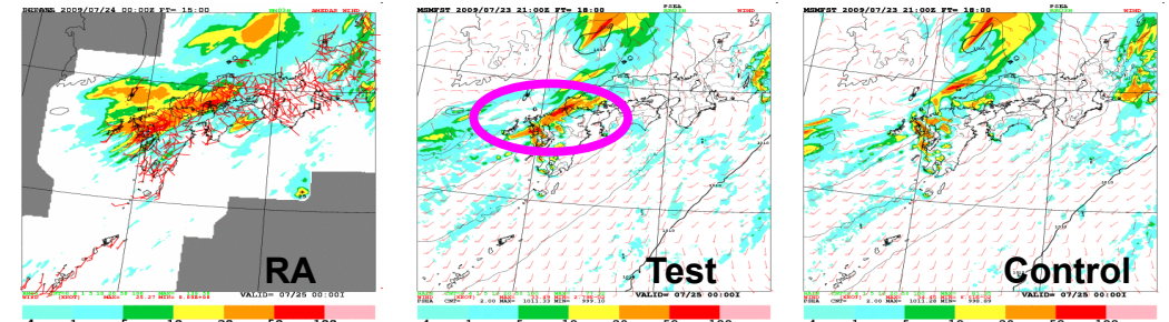
Fig. 2 Three-hourly accumulated precipitation of 18-hour forecasts from 23 Jul. 2009 at an initial time of 21 UTC. From the left, analyzed precipitation, the forecast of Test (radiance assimilation) and that of Control (retrieval assimilation) are shown.